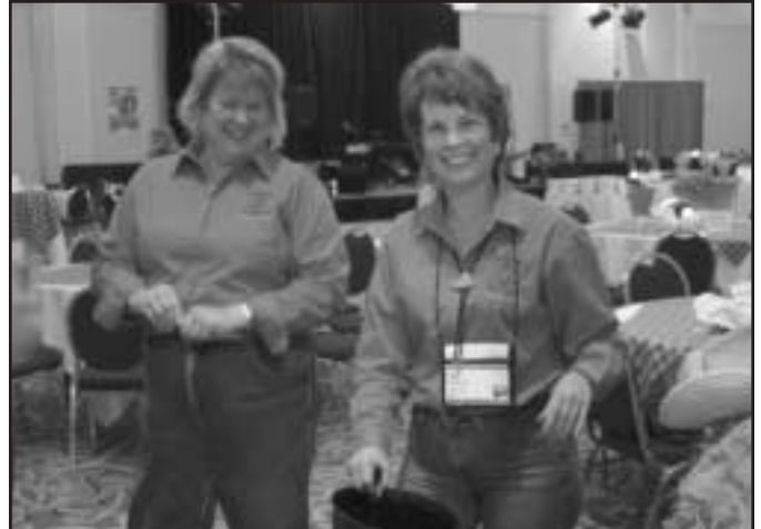
Calgary members preparing for the Thursday evening delegate Hospitality evening