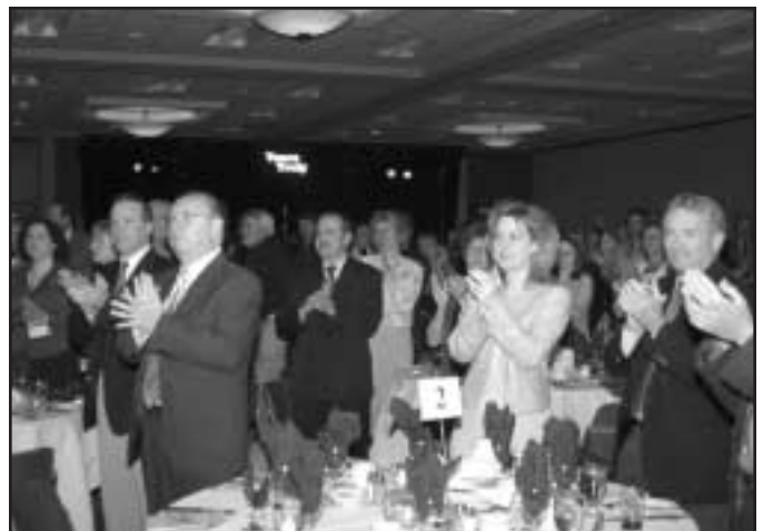
Members greet the Host Conference Committee and the banquet that wrapped up the conference on Friday, June 3rd