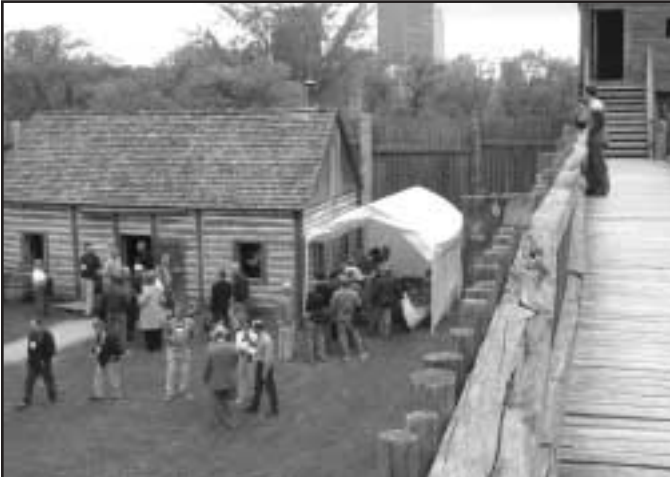
PMAC Members enjoy the scenery at picturesque Fort Gibraltar.