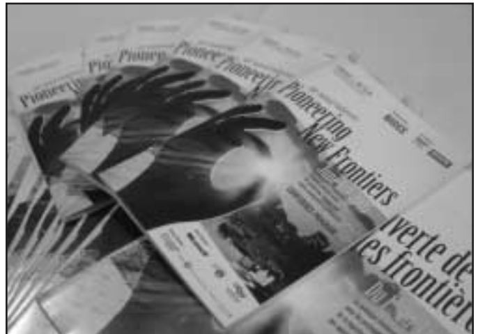
Welcome to "Pioneering New Frontiers"