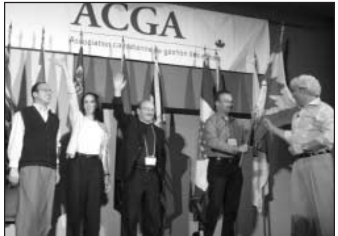
PMAC Members proudly represent Canada